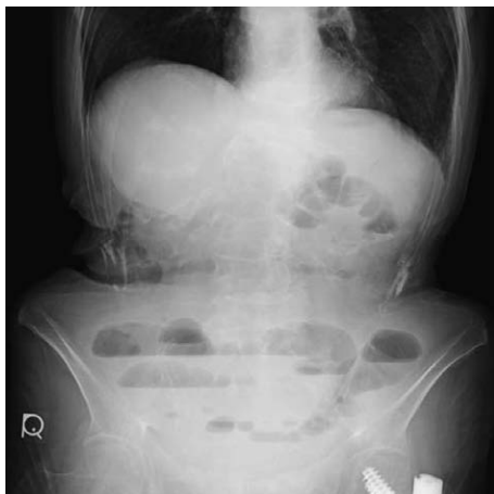
Fig. 1. Plain radiograph Plain radiograph of the abdomen showing dilated small bowel loops with air fluid levels suggestive of an intestinal obstruction.