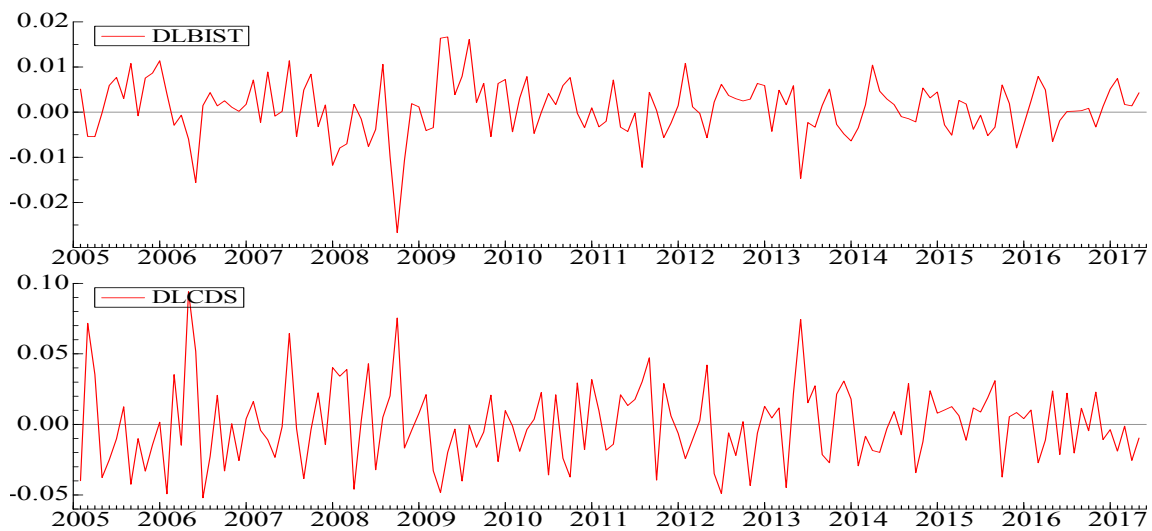
Figure 1- Time Graphics of the Variables

Firstly; it has been tested whether the variables are stationary or non-stationary. According to the MS-ADF unit root tests presented in Table 3; it has been seen that the variables of DLCDS and DLBIST are stationary (no unit root). Thus, the variables ensure the stationarity condition required for using non-linear methods.