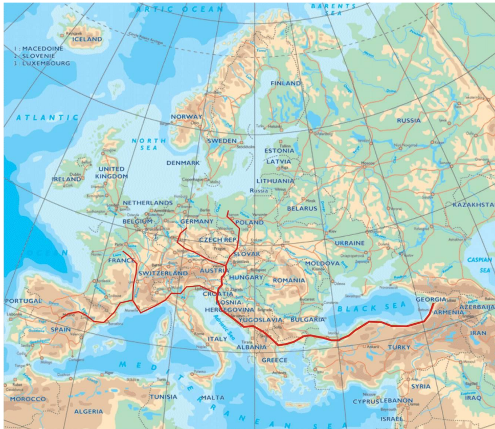
Figure 3. Possible version of water-distribution intra-European system

The construction of water pipelines in the territories of Russia, Ukraine and Moldova is unrealistic, dangerous and impossible because of the situation existing there (Abkhazia, Transdnistria, Donbas problems). In fact, the only way to Europe remains via Turkey. This route is shorter than first possible one. (Figure 3). In this case to achieve interstate agreements are easier. Through private investments (approx. 12 billion US dollars) the realization of such a highly profitable project presumably is possible in four years, which will allow for getting a multibillion dollar profit. (Silagadze and Zubiashvili, 2015; Tvalchrelidze and Silagadze, 2011)