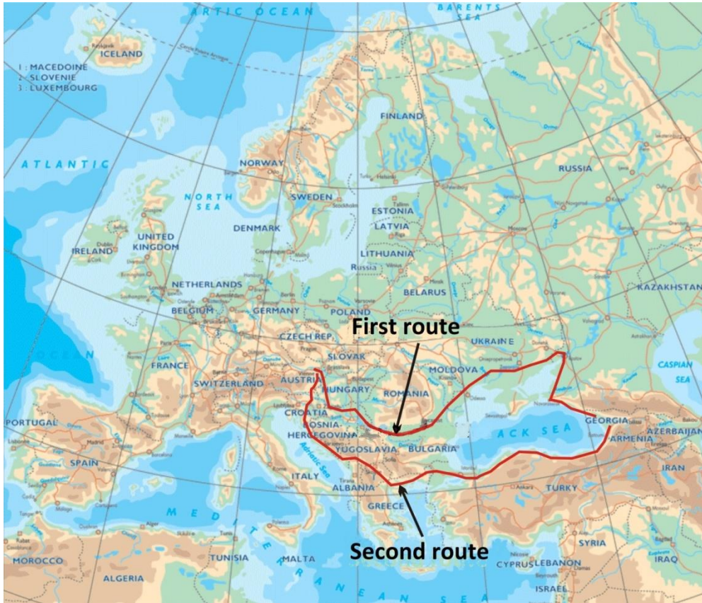
Figure 1. Possible alternative routs of the water pipelines

For the purpose of water export by pipeline, first of all, drinking water-collecting constructions should be built in the territory of Georgia. (Fig.2). (Silagadze and Zubiashvili, 2015; Tvalchrelidze and Silagadze, 2011).