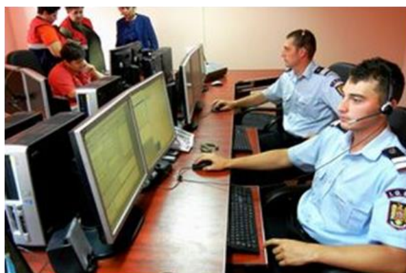
Fig.3. Dispatch I.G.S.U.