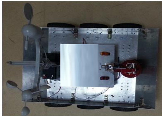
Fig. 2. Experimental model