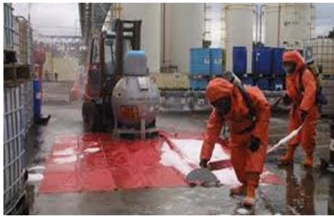
Fig.1. Intervention at an objective risk of major accidents involving dangerous substances

The modular concept of the experimental model is characterized by: