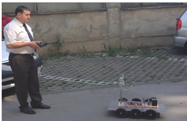
Figure 4. Testing of the experimental model.

The research is focused on the behavior and the experimental model in different situations platform. The