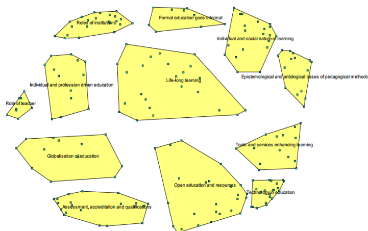
Figure 1. The landscape of the future of learning

In the center of the image is "life-long learning" as a point that connects the other clusters. It can be seen the abundance of technology in education through virtual reality that will be more and more used, mobile learning which will incorporate the PC, phone and reader in one device, augmentative reality will also be a tool more and more used, globalization of education – it is desired a single learning space for the whole Europe, where the best students to be helped regardless of their origin. The role of teachers and educational institutions tends to be an informal one, of guidance, that is in the center of the triangle technology-knowledge-student and the curriculum is intended to be an individual and personalized one, focused on practice, in which the collaboration between students can be performed internationally.