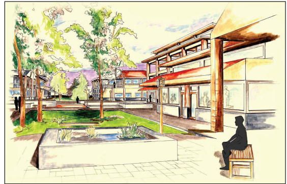
Figure 3. Mixed-use Proposal for Cascade, Idaho

Perhaps the easiest task, and one of the most important, is to invite faculty with a range of expertise to adopt the concept and methods of engaged service-learning. Adjusting position descriptions, making joint appointments to encourage interdisciplinary collaboration, and rewarding faculty for outreach efforts on par with more traditional research productivity is likely