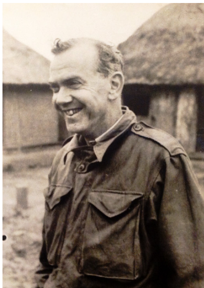
(1.0 Greene, Phat Diem front, December 1951.)

I want to ignore this Lansdale/Pyle non-debate. Instead I want to probe the novel’s rendering of history from another angle and ponder whether the Americans really were working behind French backs to promote a Third Force. But in researching the US—General Thé relationship, I quickly discovered, to my surprise, that the British were also secretly fishing in Third Force waters too—and Graham Greene was in the fishing party.