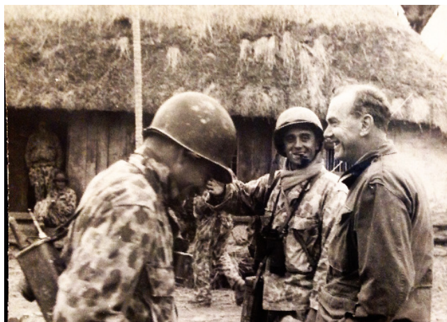
(3.0 Greene with French troops, Phat Diem, December 1951.)