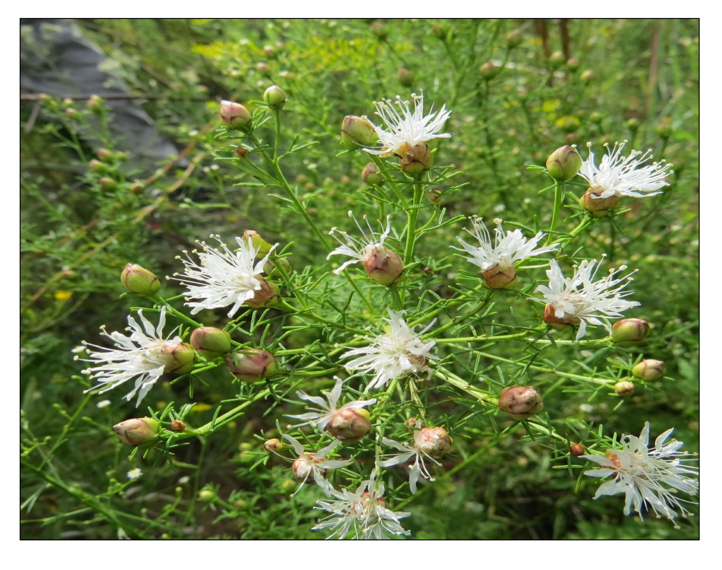
(Fig. 1: Dalea pinnata var. trifoliata )

The fields of phylogenetics and phylogeography focuses on the relatedness of species through temporal and spatial lenses. (Avise 2000) These fields grow every year as science's understanding of the genetic code continues to expand, and this research study will contribute further to these studies with a focus on botany by reviewing how a genus of southeastern native plants, Dalea (Fabaceae) (Fig. 1 &2),