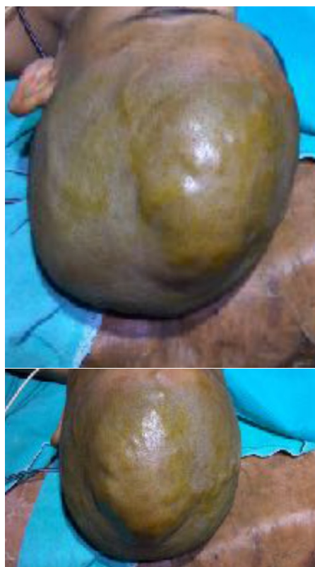
Figure 1 - Lesion over scalp

Various names are used to describe the vascular malformations of the scalp, including aneurysm cirroides, aneurysm serpentinum, plexiform angioma, arteriovenous fistula, and AVM. The most frequent sites of involvement are frontal, temporal, and parietal regions. (11, 12, 13, 14) The origin of the main feeder is in the subcutaneous tissue of the scalp. The origin of these main feeders, most frequently, arises from the external carotid, occipital, and supraorbital arteries. The superficial temporal artery is frequently involved in traumatic cirroid aneurysm due to its long unprotected course. (4)