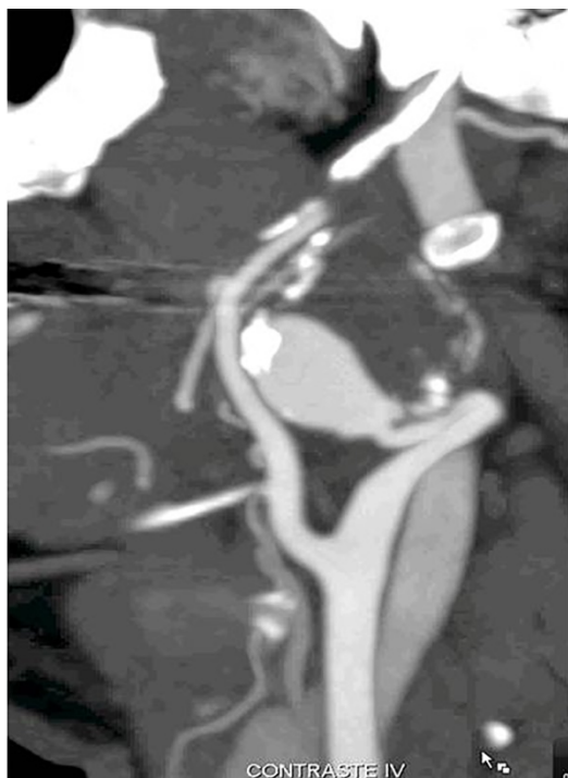
Figure 3 - Angio- CT Scan: Lateral View of the right carotid axis

The initial planning was to perform embolization through exclusive stent application, thus, a guide is navigated distal to the lesion, trying repeatedly to navigate the stent in the vessel and coating the aneurysm ostium. Kinking rectification maneuvers (cervical hyperextension, cephalic limb contralateral rotation, apnea in maximum inspiration, buddy wire technique with guide 0.014, and hydrophilic Terumo® guide) were failed. Because of the risk of dissection secondary a forced maneuver in a patient without collateral circulation, it was decided to engage the maneuver and proceed to the coils placement. The coils were deployed according to the usual technique, covering the entire aneurysm sac without complications. A