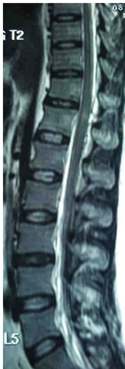
Figure 2 - MRI dorsolumbar spine showing hyper intense signal in spinal cord at upper border of D12 level without cord compression