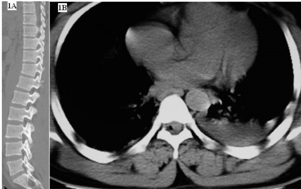
Figure 1 - Sagittal spinal CT image revealing undisplaced fracture of parsinterarticularis and pedicle of D12 vertebra (1a) and axial chest CT scan showing intradural droplet of air at D12 vertebra level (1b)