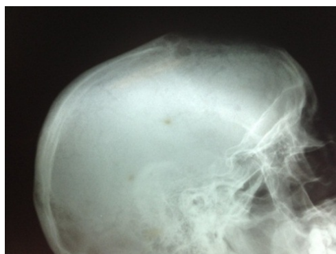
Figure 2 - Lateral plain cranial radiography showing multiple bone lesions in the frontal area of the skull