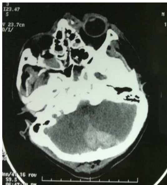
Figure 1 - CT scan showing hyper-dense blood in posterior fossa region causing pressure on fourth ventricle