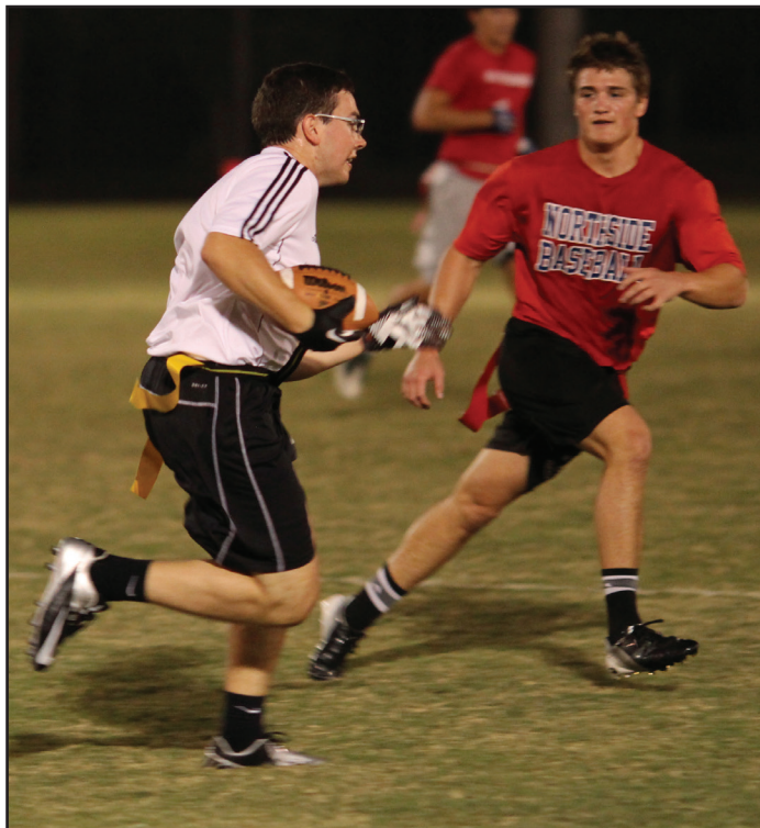
Students at UNG Oconee enjoy intramural sports on their campus by playing flag football.

UNG offers a variety of recreational sports in a safe environment to create a life-long involvement across all campuses.