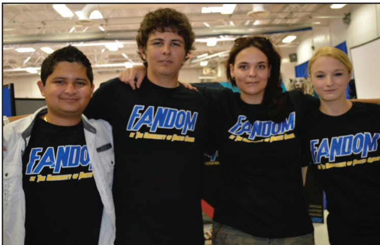
Fandom Club showing their spirit at New Student Orientation

Positions are filled for now, but will be up for grabs this semester. The club is all about encouraging interaction with the student body.