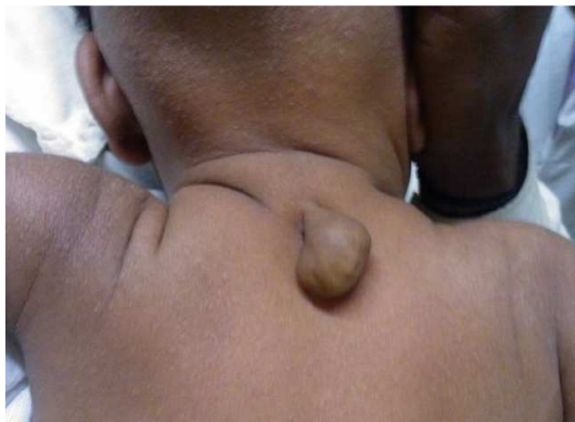
Figure 1 - photographs of patient showing pedicled swelling in cervical region

An 11 month old male child presented with swelling in cervical region, opposite C6-C7 vertebral level (Figure 1). There was no history of delayed milestones or any history suggestive of urinary or faecal incontinence. General physical examination was unremarkable except a pedicled firm swelling in cervical region. No other cutaneous stigmata of spinal dysraphism seen along the spine. Fontanelles were open and not bulging. Neurological examination revealed no sensory-motor deficits and normal bowel bladder function for the age. On X-ray of cervical spine posterior arch elements of C6 and C7 vertebrae were deficient in midline. MRI showed a solid cystic extra cutaneous lesion against C6-7 vertebral level pedicled to the dura at C6 level. Two intradural cystic lesions and one heterogeneous intramedullary solid lesion were seen (Figure 2).