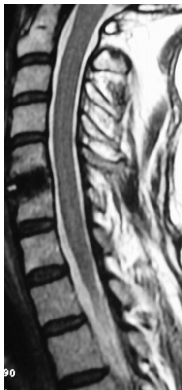
Figure 4 - Sagittal T2 weighted post-operative images through the cervical spine demonstrating remarkable reduction of the syrinx