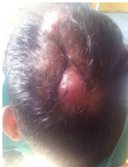
Figure 1 - Clinical photograph showing multiple scalp nodule near to the surgical incision site

surgeries. He had residual right hemiparesis after at the second time of surgery which was pressing. There was no history of fever, loss of consciousness or seizures. His general and systemic examination was normal. Neurologically he was conscious, alert and oriented to time place and person. He had mild aphasia and grade 3/5 weakness of right upper and lower limbs. There was patchy loss of hair over scalp. There were multiple hard, non-tender nodules over the scalp and along the previous craniotomy incisions site (Figure 1). MRI brain showed extensive recurrence of the tumor. Post-contrast images showed that the tumor was extending along the trajectory of the incision and extending extracranially into the subgaleal plane (Figure 2).