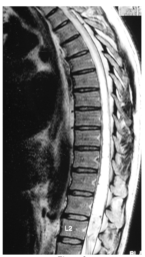
Figure 2 T2-weighted sagittal MRI of the Thoracic spine demonstrates thoracolumbar syringhydromyelia