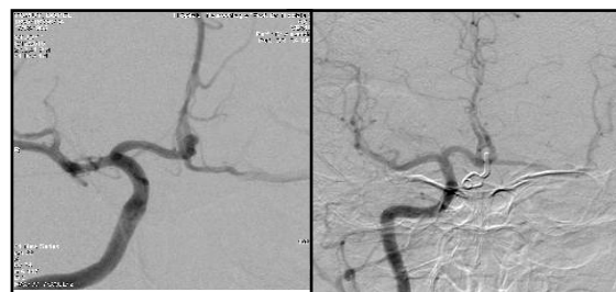
Figure 3 DSA pre and post microsurgical clipping of ACoA aneurysm

The procedure was performed by o right femoral access using an 8Fr sheath. First, an umbrella filters was placed 10 cm above carotid bifurcation as embolic protection device. An 8/30 mm tapered Xact Carotid Stent (ABBOTT) was used for stenotic portion dilatation of carotid artery. Afterwards, the umbrella filters was retracted and a control injection was performed. The patient was discharge at home 3 days later.