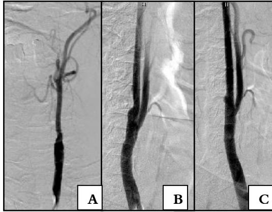
Figure 4 DSA showing A left ICA occlusion; B right ICA stenosis; C right CA dilated with stent

The neurological symptomatology remitted completely two weeks later (Figure 4 B, C).