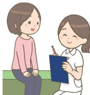
FIGURE 1 Fast touch. Assessment of severe complaints