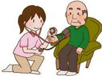
FIGURE 2 Vital sign measurement Medical interview