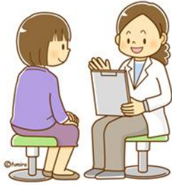
FIGURE 3 Medical examination