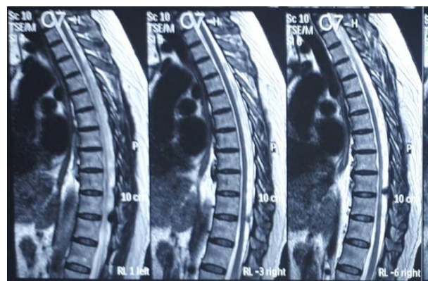
FIGURE 1: T 2 sequence of thoracic MRI sagittal and axial view, hypo signal extradural lesion which compress the thecal sac from posterior