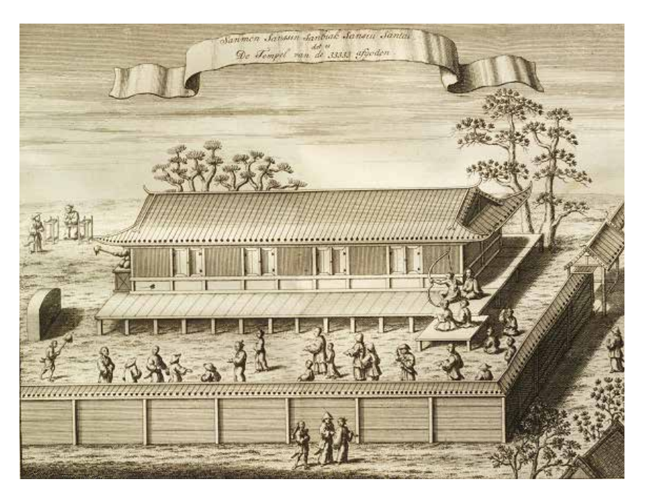
Fig. 2: The Temple of the 33333 Idols.