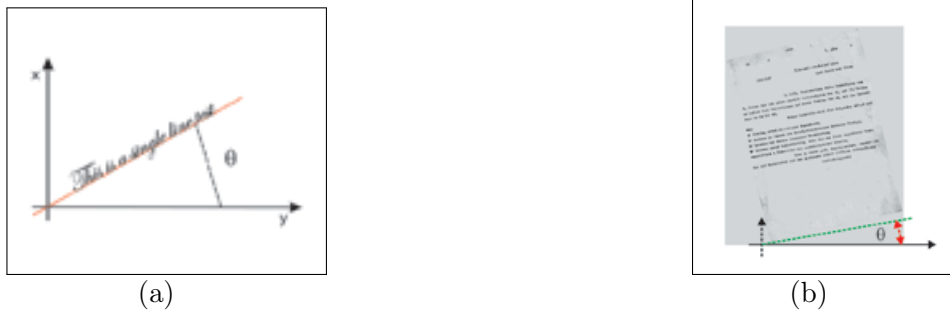
Figure 4: Dataset rotation: (a) Synthetic dataset, (b) Real dataset

Real dataset consists of document image samples given in the resolution of 150 and 300 dpi. They are rotated for the angle \theta , from 0^\circ to 10^\circ by 1^\circ and from 10^\circ to 40^\circ by 5^\circ steps around x -axis. Figure 5 shows document samples of the real dataset in Latin, Serbian Cyrillic, Chinese and Greek Cyrillic (excerpt from ICDAR 2013 text skew test).