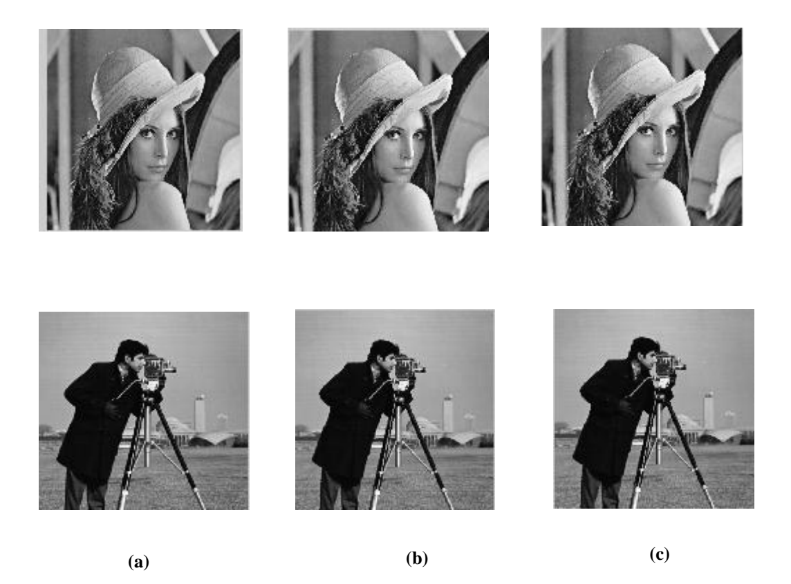
Figure (2) Results of applying traditional IBTC (a) Original image(b) Reconstructed image (c) Embedding image with payload (1024)

Table (2) shows the amount of payload and the PSNR values for both reconstructed and embedding images.