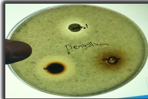
Figuer(B) illustrated Pencillium