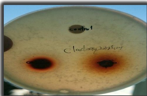
Figure (A) illustrated Cladosporium

The different letters indicate there are significant differences ( p \geq 0.05 ) among the group (vertical comparison).