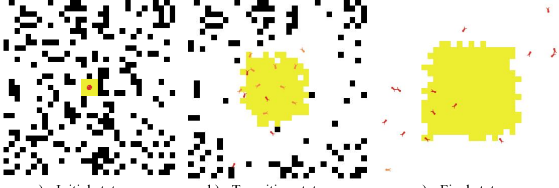
a) Initial state b) Transition state c) Final state Figure 2: different phases for model simulation in NetLogo Black : to be moved, yellow: already moved.

the space. Agents did not dispatch yet. Figure 2b shows a transition state where agents still collect file fragments onto contagious space.