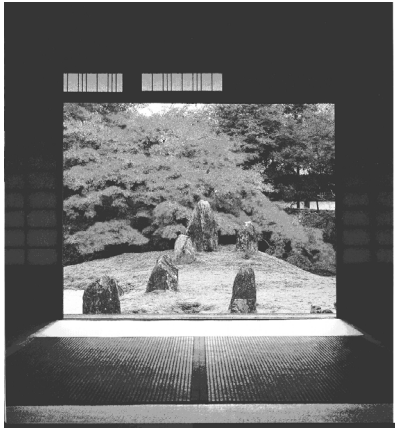
Figure 4: Picture of Kōmyōin (淡交社編集部『そうだ京都, 行こう』 淡交社2004年)

tion of a garden. Figure 4 is an actual picture of Kōmyōin ; it shows this arrangement of stones is not only composing the garden, but stones are also used for visual effect. His works were not limited to Zen temples, he also designed a garden at Kishiwada castle and at Shinto shrines such as Matsuo Taisha . Figure 5 is Shigemori's old residence in Kyoto, which was used in TV advertisement for Sharp Liquid Crystal Display and is now open for visitors. The use of prominently placed stones is a defining feature of his designs, which not surprisingly are generally of the Karesansui , dry landscape, style. In other words, Shigemori emphasized the importance of stone arrangements in gardens in both theory and practice.