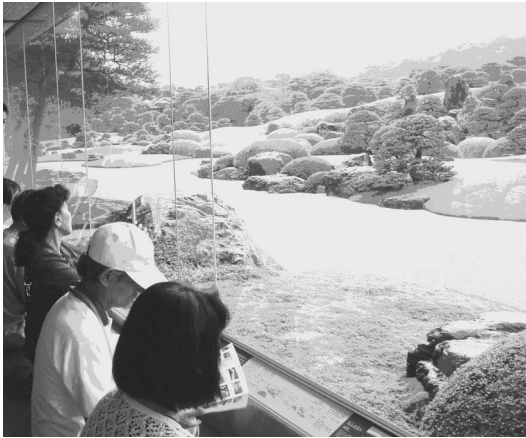
Figure 1: Adachi Museum of Art Garden