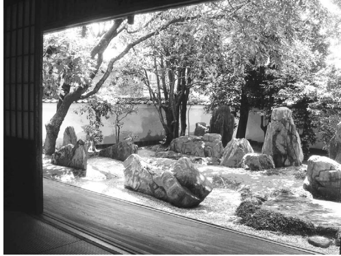
Figure 5: Shigemori's Residence in Kyoto

understand how the stone are arranged. Shigemori's method is grounded in the idea that a viewer should be able to identify a garden's structural design before appreciating it in an aesthetic way.