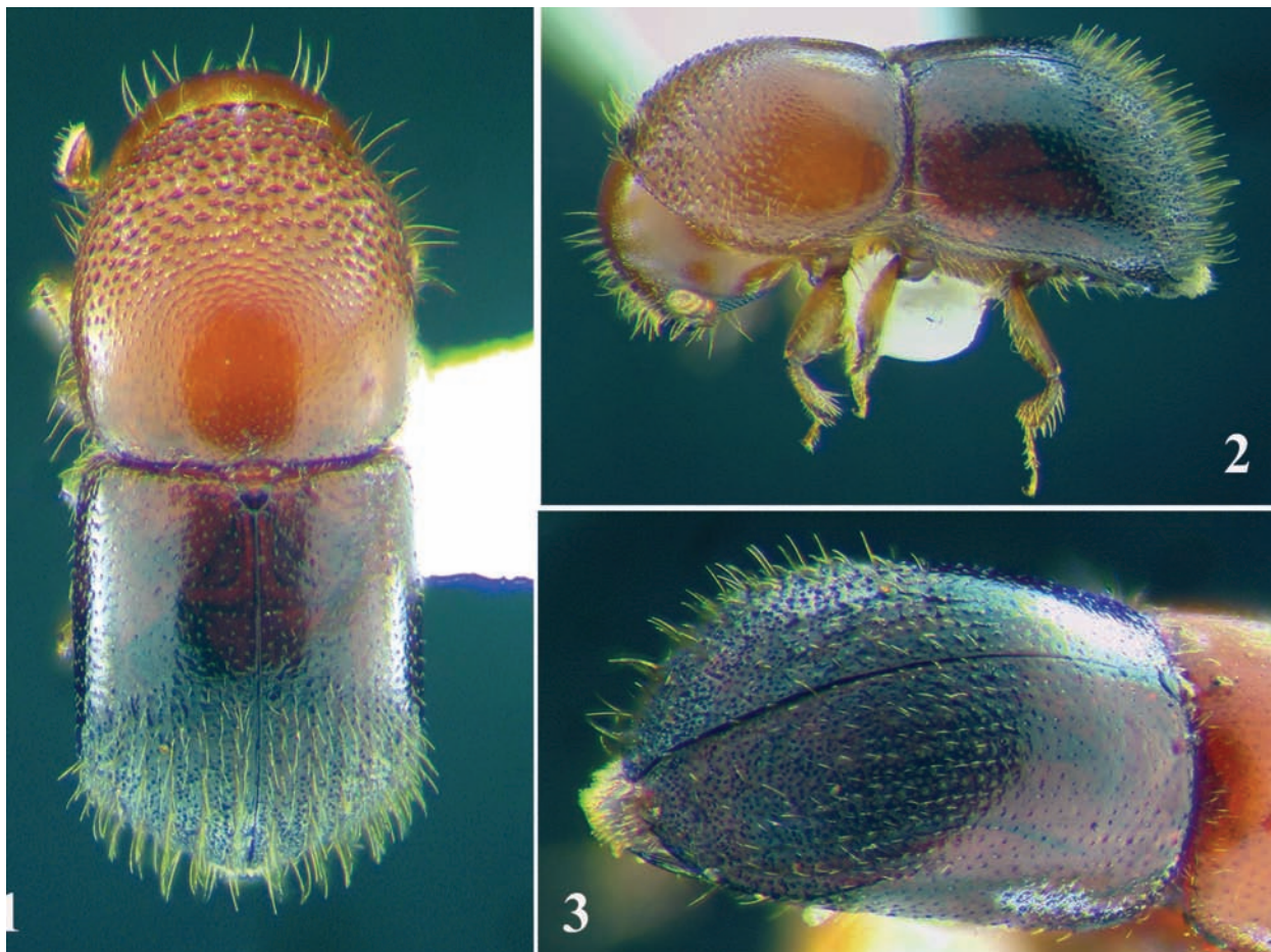
Figs. 1 – 3. Xylosandrus crassiusculus – female. (1) dorsal view, (2) lateral view, (3) elytral declivity

observed on the main stem and branches of the trees. Adults bore into the stem and construct galleries. All life stages could be observed within the galleries (Figs. 11 to 13). Xylosandrus crassiusculus construct radial, irregular galleries within the sap wood (Figs. 11 & 12) and extrude wood powder and frass in the form of a single thread (Fig. 9), while the galleries of D. corpulentus are more or less vertical and irregular (Fig. 13) and extrude shapeless mass of wood powder through the bore holes (Fig. 10). Shedding of leaves, drying up of branches and death of trees (Fig. 7) were observed.