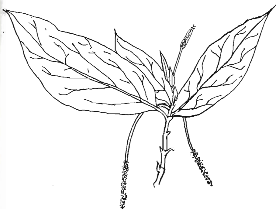
Fig. 1. A twig of P. barberi