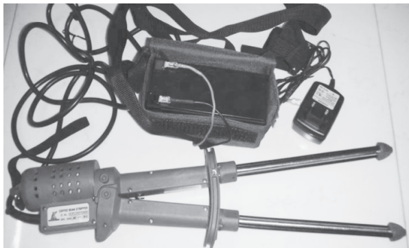
Fig. 2. Indigenous harvester (Coffee bean stripper)

which the tree is shaken, the height of the tree, the strength of bond between the berries and the tree, the duration of exposure to shaking and the mass of the berries.