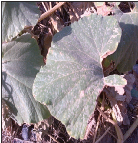
Figure 4: Showing infection of powdery mildew on Cucumis sativus