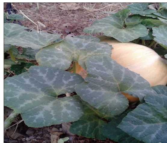
Figure 2: Showing infection of powdery mildew disease on Cucurbita moschata

Five samples from each cucurbits as Cucumis sativus (cucumber), Luffacylindrica (sponge gourd), Cucurbitamoschata