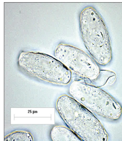
Figure 7: Showing the conidia of Sphaerotheca fuliginea with fibrosin bodies

(26.46cm) as well as the breadth (24.57cm) followed by Kofar Durbi, length (23.52cm) and breadth (19.74cm); Low Cost, length (22.70cm) and breadth (18.62cm) and smallest in Kofar Sauri, length (17.03cm) and breadth (12.39cm). The L/B index of spores was found highest in Kofar Sauri (1.37) followed by Low Cost (1.21), Kofar Marusa (1.17), Kofar Durbi (1.14) and lowest in Barhim Estate (1.07) (Table 2).