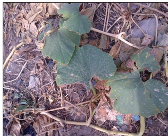
Figure 3: Showing infection of powdery mildew disease on Luffa cylindrica

On the basis of shape and size of spores the species of powdery mildew was identified as Sphaerotheca fuliginea on the entire included cucurbit crops from all the localities of Katsina (Table 2). In the conidial dimensions of the powdery mildew, the length of the spores was largest (Figure 7) in Barhim Estate