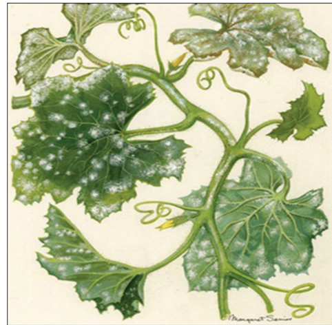
Figure 6: Showing infection of powdery mildew disease on Cucumis melo