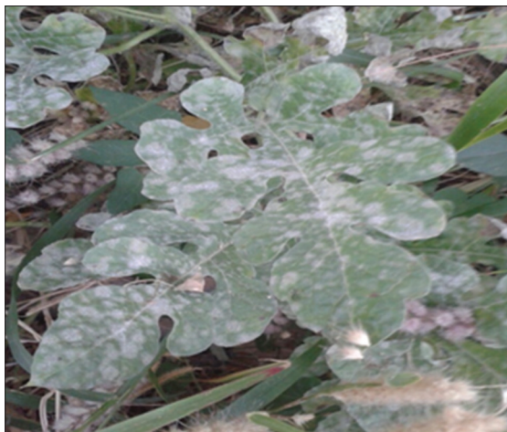
Figure 5: Showing the powdery mildew infection on Citrullus vulgaris