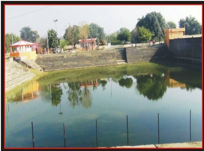
Fig. 1: Showing view of study area (Datte-da-Talab pond)

different sides of the concrete rectangular pond. (Fig. 1)