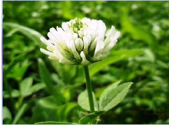
Figure 1: Typical flower of T. alexandrinum

petals while the stigma is surrounded by stamen. T. alexandrinum fruit is formed by the enlarged calyx at maturity. Calyx enlarges at maturity to form a box capsule that contains single seed. Nectar is secreted by the nectarines that open at the base of the stamens and gets collected in the corolla tube. The mean corolla length was 4.1 \pm 2.2 mm (3.1-4.9 mm). Similar observations on the floral arrangement were also made by McGregor (1976) and Kennedy and Mackie (1925).