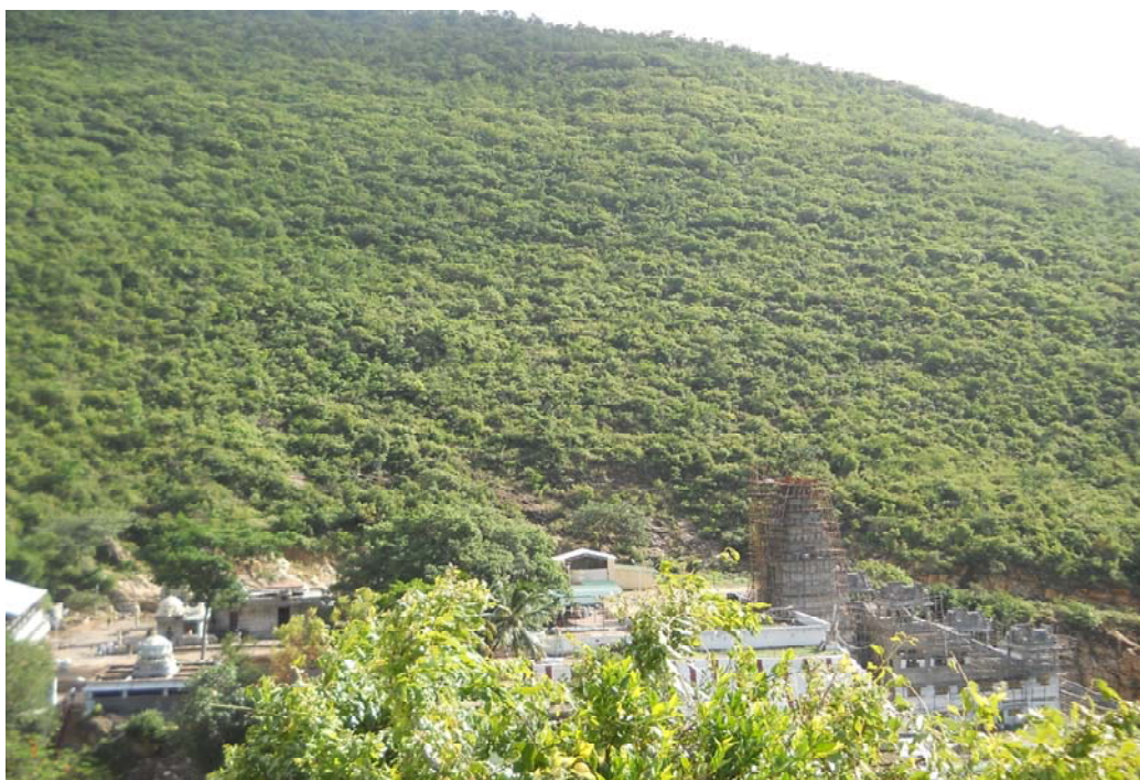
Figure 1. A View of Maruthamalai Hills

latitude (Figure 1). The area has a predominant red soil impregnated with organic matter, and granite, bed rock is overlaid with shallow, sandy loam, and glacial soils are moderate to well drained. Temperature begins increasing after March and April is the hottest month with a near daily maximum temperature of 38.2°C and maximum of 25-6 °C.