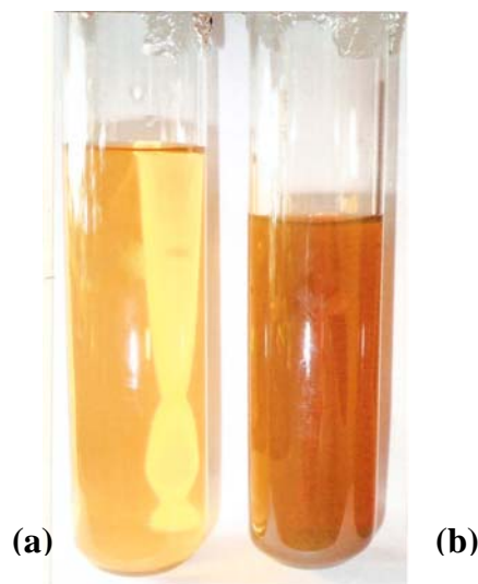
Fig-1: The colour change of plant extracts after addition of silver nitrate (a) Plant extracts; (b) Silver nanoparticles

of SNPs had been confirmed by measuring the UV-Vis spectrum of the reaction media. The UV-Vis spectrum of colloidal solutions of SNPs synthesized from Svensonia hyderabadensis have absorbance peaks at 300 nm and the broadening of peak indicated that the particles are poly-dispersed (Fig-2).