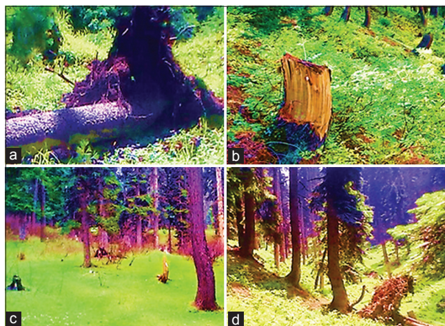
Figure 3: Anthropogenic factors such as grazing and habitat fragmentation affecting natural populations of E.elatum (a)-Dangarpora-Sheeri Baramulla forest; (b)- Sheikhpora-Gurez Bandipora forests; (c)-Drang-Tangmarg forests; (d)-Yusmarg-Budgam forests

long-term viability of rare and endangered species, a minimum population size is necessary [37 and 38]. Our research efforts have proved that E.elatum is facing extremely severe threats in Kashmir Himalayas. Therefore, medicinal plant needs immediate captive cultivation. Research has proven that plants produce higher levels of active components when grown within their suitable agro-climatic environment [3]. E.elatum also produces higher content of key bioactive markers such as Epimedin ABC and Icarin [11 and 14]. Therefore, efforts are needed to promote it as a potential medicinal herb for the future in the Indian Himalayas.