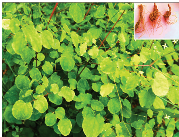
Figure 1: E.elatum (Morr & Decne) of Berberidaceae family is shown here growing under cultivation at Yarikhah field station, CSIR-IIIM Jammu. Both underground & aerial parts are used for ethnomedicinal purposes

The study area comprises of pleasant and sub-alpine regions between 33°20–34°54' N latitudes and 73°55'–75°3' E longitudes in the Northwestern Himalayas in India (Fig.2). Information on its taxonomy and distribution was documented by reviewing the pertinent literature and scrutinizing herbarium sheets at University of Kashmir, Hazratbal, Srinagar J&K. Extensive exploration was made between June to September of 2013-2015 (flowering & fruiting time) based on reported localities (herbarium archives, written floras, research papers and internet search engines). Multiple parameters were recorded such as no of populations in 1km 2 area, herbivory and vulnerability score (0-3), and area of occupancy (Table 1). The plants were identified by taxonomists and the herbarium specimens were deposited respectively in Herbarium of University of Kashmir (KASH), Hazratbal, Srinagar and CSIR-Indian Institute of Integrative Medicine (CSIR-IIIM Jammu, J&K, India [14 and 15].