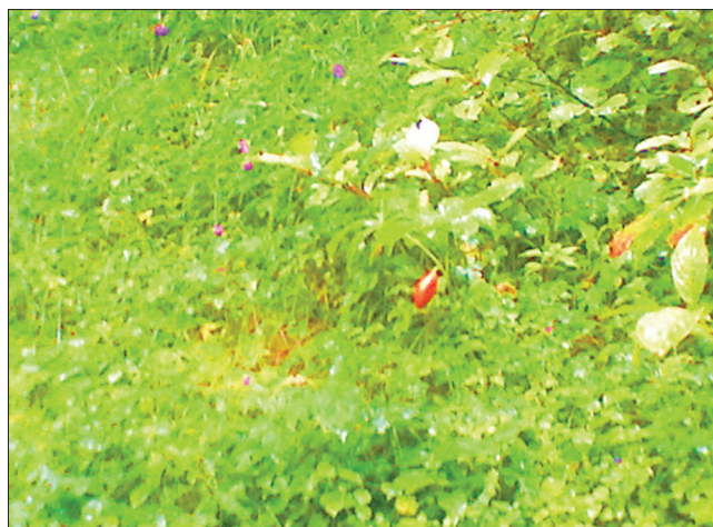
Figure 4: Podophyllum hexandrum and E. elatum growing together in Gulmarg. Both were mostly seen commonly associated species during the study

Podophyllum hexandrum was found to be the common partner of E. elatum in most habitats like PGM, DGM, NAR, KNG, VNG, GL, GG and Gurez except Checknala (Fig.4).