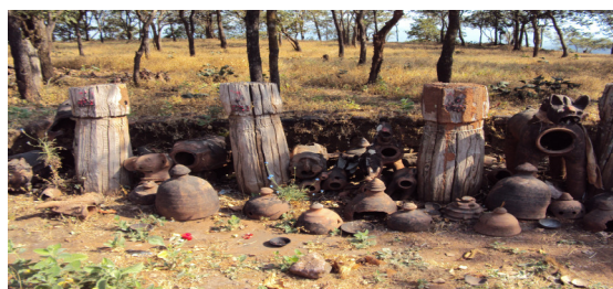
Fig 6. Sendhani Mata Sacred Grove