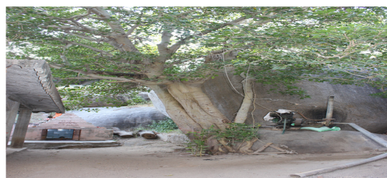
Fig 3. Mukteshwar Mahadev Sacred Grove