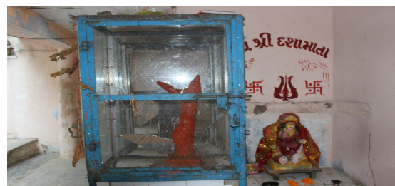
Fig 4. Old wood of Aegle in Mukteshwar Sacred Grove