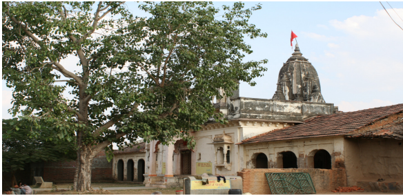
Fig 7. Shankar Mahadev Sacred Grove

Around 20 km from Mukteshwar, a famous Shembharia Goga Maharaj Sacred Groves is situated on the bank of the river saraswati near the forest area of Shembhar village. where plants are conserved in a boundary near the Shembharia Goga Maharaj Sacred Groves. The main plants species that are