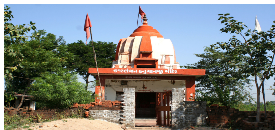
Fig 5. Hanumanji Mandir Sacred Grove