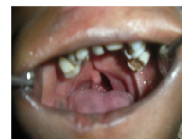
Fig 2. Intraoral soft tissue examination showed bilateral cleft palate extending from pre-maxilla to soft palate.

Received: Oct 15, 2011; Revised: Nov 02, 2011; Accepted: Nov 22, 2011.