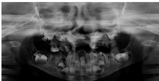
Fig 3. OPG revealed bilateral maxillary cleft and missing maxillary permanent right and left central incisors teeth and mandibular permanent second premolar teeth.

Dental examination revealed mixed dentition, malaligned teeth and missing deciduous right maxillary central incisor and deciduous left maxillary central and lateral incisor teeth. Orthopantomogram (OPG) revealed bilateral maxillary cleft and missing maxillary permanent right and left central incisors teeth and mandibular permanent second premolar teeth. (Fig. 3). As the defects were present at the time of the birth it is a congenital defect. The defect was associated with congenital lip pits, cleft palate, operated cleft lip, and hypodontia, a provisional diagnosis of Van Der Woude syndrome was made. The patient was referred to the department of oral and maxillofacial surgery for correction of lower lip defects and cleft palate.