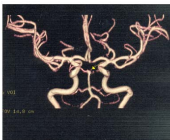
Fig.3 showing bulbosity of the basilar artery.Arrow indicates bulbosity