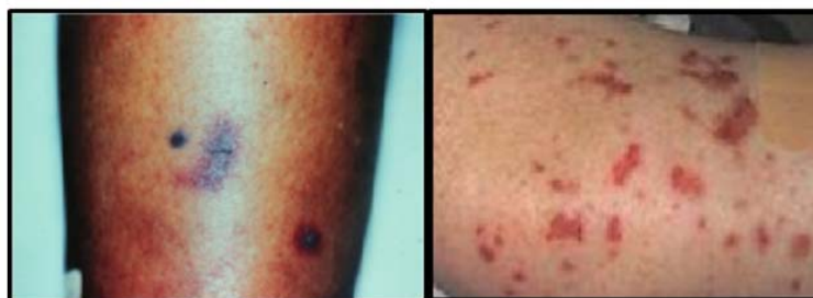
Figure 1- Skin involvement in Churg-Strauss syndrome (CSS). Biopsy showed vasculitis of the skin and abundant eosinophils, which are characteristic in CSS

myalgias and migratory polyarthralgias. Myositis may be present with evidence of vasculitis on muscle biopsy. (Figure-1)