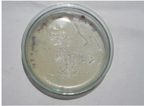
Fig.2a. Fungal population studies by using dye affected soil medium