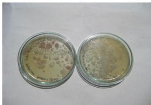
Fig.1b. Bacterial population studies by using fertile soil medium