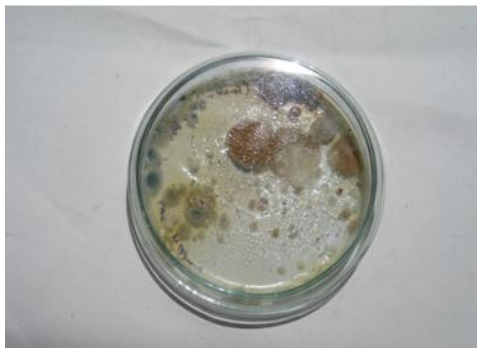
Fig.2b. Fungal population studies by using fertile soil medium