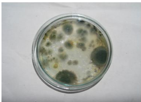
Fig.2c. Fungal population studies by using vermicompost medium