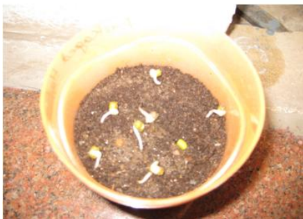
Fig.3e. Germination studies by using vermicompost and fertile soil medium