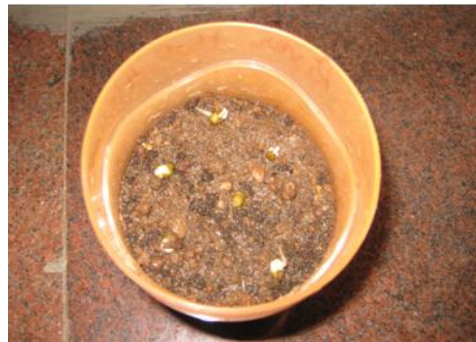
Fig.3a. Germination studies by using dye affected soil medium