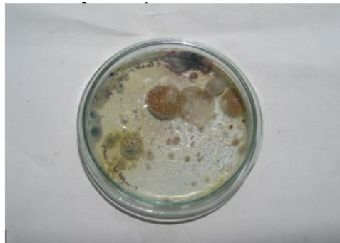
Fig.2d. Fungal population by using mixture of vermicompost and dye affected soil medium