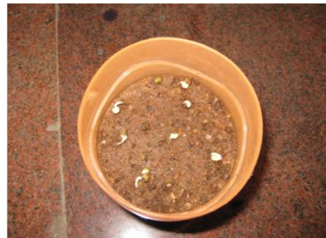
Fig.3b. Germination studies by using fertile soil medium