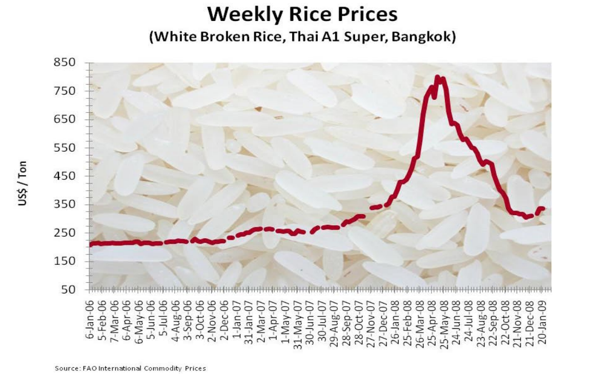
Figure 2 Weekly Rice prices