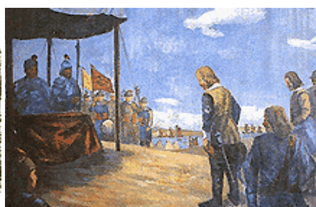
Dutch surrendered to Cheng