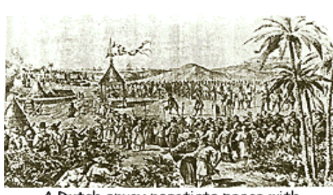
Figure 4. The events of the Dutch loss Formosa.

As he reached his apex power in 1658, he attempted to capture Nanking, but it was failed and caused him lost his influence. He then felt insecure, let alone he had to seek a new place for refuge and pedestal of resistance. Since suffered from supply deprive because Ch'ing Manchu cut off his sources of supply, he was constrained to attack Formosa in 1661 and instituted headquarters there.