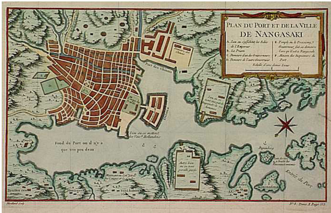
Deshima in 1761