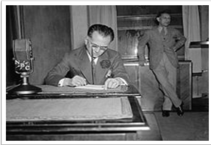
Picture 1. Quezon was one of the Filipino leaders admired by Indonesians