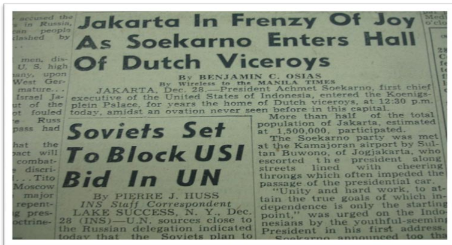
Picture 9. Newspaper article showing Soviet opposition to the entry of Indonesia into the United Nations.