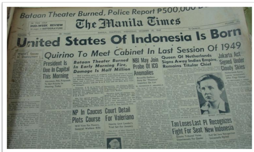
Picture 4. The Manila Times , December 28, 1949.

The same paper described the details of the recognition of the country's independence by Queen Juliana in the Netherlands. Headlined "Queen of Netherlands Signs Away Indies Empire, Remains Titular Chief" ( Manila