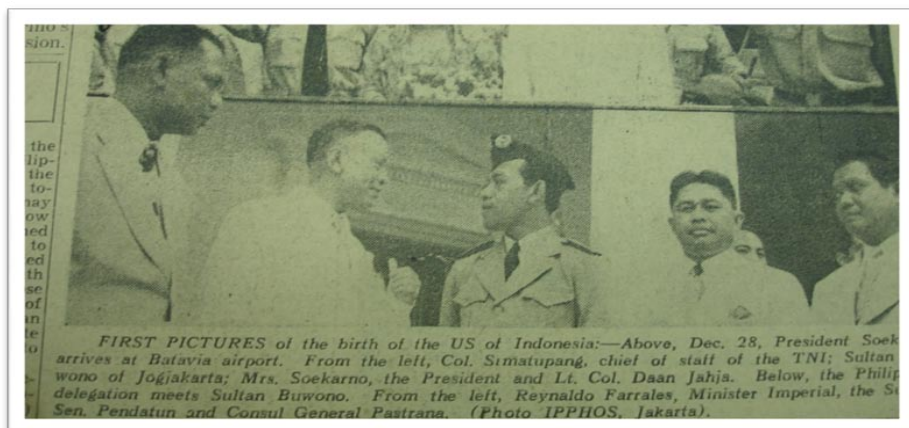
Picture 7. More photographs from the Manila Times of December 28, 1949

In his speech, his first address to the nation, Sukarno called for “unity and hard work, to attain the true goals of which independence is the only starting point,” “I am the servant of the people, not their master, he said. The crowd stayed on and cheered every phrase of his speech. “As the constitution demands, I will serve God and the people. Sovereignty for Indonesia is the beginning not the end of our history,” he said. “Peace within” Sukarno described as an added requisite to maintain peace against forces outside the country. Sukarno then said that the next goal for free Indonesians is New Guinea. “We now are peaceful terms with the Dutch and other foreigners. Show hospitality toward them,” Sukarno added. Sukarno and other Indonesian leaders fought a four-year guerrilla war against the Dutch who tried to regain the archipelago after World War II. Finally, Sukarno said that everyone must work, as we never worked before. With solid unity, we must give prosperity to Indonesia and foreigners to restore our economic stability and heal the wound caused by war. God gives us peace” ( Ibid. ).