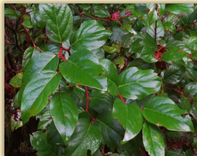
Salal, photo by author, 2013.

S-Comm and OPSG are just a few of the federal programs which have placed state and local law enforcement agencies directly in the middle of primary immigration enforcement. Although interoperability may appear on the surface to be a logical approach to extending scarce resources, it also opens the door for Border Patrol officers to piggyback on the authority of local police to stop and question someone, thereby gaining access to question people about immigration status that they would otherwise not have. This potentially places state and local police in the position of violating Washington State Constitutional standards to which they are also accountable, even if Border Patrol is not. 84