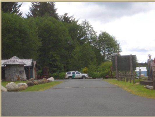
Border Patrol at Kalaloch Beach, Olympic National Park photo courtesy of FHRG .2012.

Border Patrol's actions have frightened the community in a number of ways. First, officers have maintained a conspicuously high-profile presence at many of the places where people go to take care of daily necessities, including the DSHS (welfare) office, Food Bank, Post Office, Thriftway, Courthouse, and outside people's homes. Officers have even stood in the woods watching people while they worked.