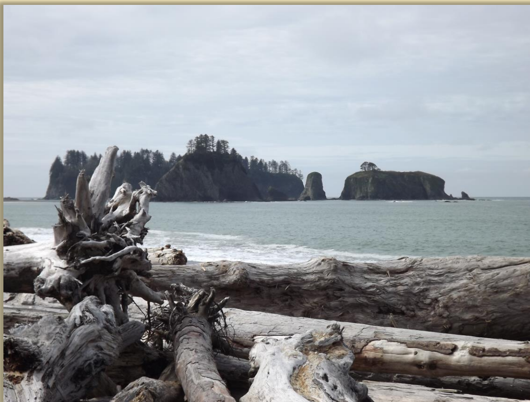
Rialto beach, Olympic National Park, 2012.

There is a heavy social cost attached to Border Patrol's involvement in interior immigration enforcement. Everyone pays the price. First and foremost, the families who have been splintered apart have paid the most dearly. Children, many of them U.S. citizens, will continue to pay the price of long-term psychological trauma, along with the disruption of their education and involvement in the community, for years to come. The entire community pays the price of undermined security when a major segment of the population lives in fear of coming forward with information that would be useful to law enforcement. Many have suffered, and many have worked hard to bring about change, both in the microcosm of Forks, Washington and across the northern border. The community members who came forward to share their experiences in this report have exhibited tremendous courage. By doing so, they have made an invaluable contribution to the pressing national debate for comprehensive immigration reform.