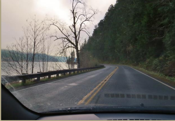
Road around Lake Crescent, photo by author, 2013.

In 2010, a family was driving around Lake Crescent when Border Patrol passed them in the opposite direction, did a U-turn, and followed them for twenty miles but never pulled them over. 101