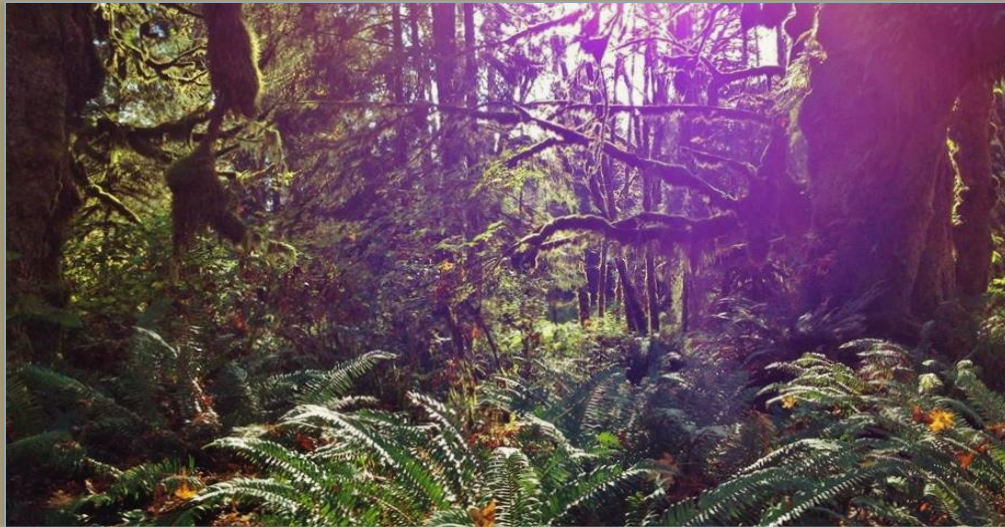
Rainforest near Forks, photo courtesy of FHRG, 2013.