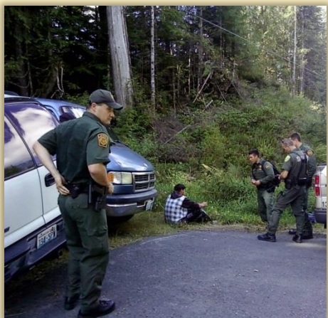
Photo from FHRG log, Border Patrol detention of salal harvester, 2010.

An example of this, described in seventeen of accounts, is the practice of following a vehicle closely for a distance without pulling it over, instead waiting until the driver has reached a destination or pulled over on his own, often out of fear or to ask why he was being followed.