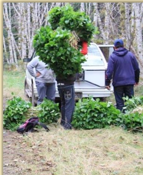
Salal harvesting, 2013.

In 2008, Border Patrol stopped a family at a fixed highway checkpoint five miles outside of Forks and asked for their salal harvesting permit, even though the family was not headed to or from harvesting. The entire family, which included three children, was detained. 30