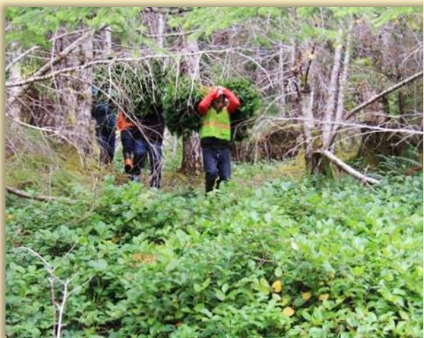
Harvesting salal, November 2013

A second important but often-blurred distinction is whether a person voluntarily consents to questioning. An officer does not need any suspicion to ask questions, as long as the person feels free to walk away. On the Peninsula, many encounters have taken place in the woods or on secluded forest roads. These locations are often out of cell phone range, and it is unlikely that anyone would feel safe or free to walk away. In fact, it is well-known in the community that those who have tried to leave under such circumstances have faced escalation and increased danger, as clearly described in seven accounts, including that of Benjamin Roldan Salinas. 59