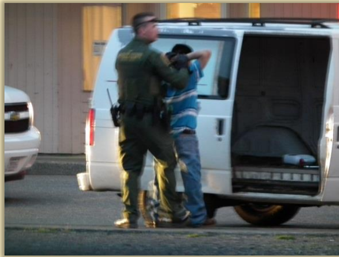
Detention by Border Patrol, photo courtesy of FHRG, 2011.

alternatives. However Congress maintained the mandate at 34,000 and ordered ICE to spend nearly $400 million more than they requested. 49