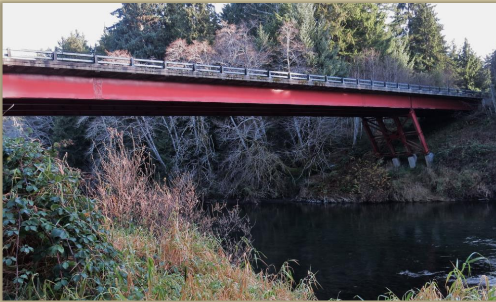
1 Bridge over the Sol Duc River, photo by author, 2013.