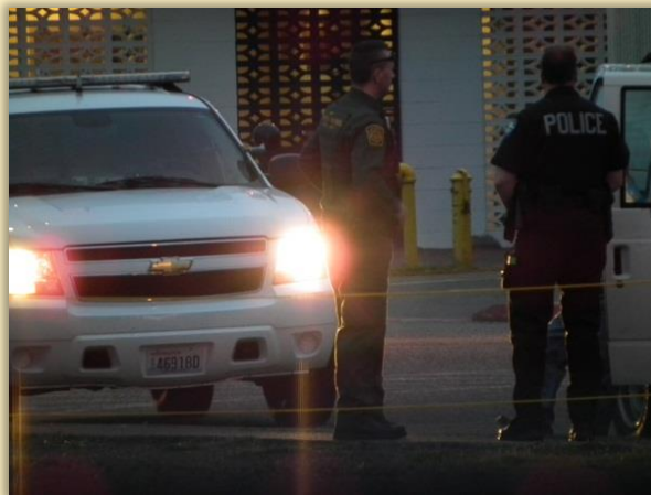
Photo from FHRG log, Border Patrol and Forks Police in Forks, 2011.

In 2010, a man was leaving the Forks courthouse after attending a hearing for driving with a suspended license. The judge had granted him time to pay off his outstanding traffic tickets and scheduled a follow-up hearing. However, Border Patrol picked him up as he left the courthouse and deported him, leaving his wife and four citizen children on their own. Later, Forks Police came to the man's house with a bench warrant for his failure to show up for the traffic hearing. They even tried to mistakenly use the warrant to arrest his 14-year-old son who shared the same name. 74