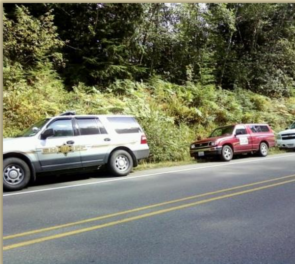
Border Patrol parked on Highway 101, photo courtesy of FHRG, 2010.

In addition, Border Patrol has used methods of stopping people on the Peninsula that were designed to intercept recent border crossers and contraband. First, Border Patrol set up fixed highway checkpoints on Peninsula Highways in 2008 and 2009, during which time 24,524 vehicles carrying 41,912 people were stopped at 53 roadblocks. Eighty-one undocumented immigrants were detained, and nineteen people were turned over to other agencies for state crimes, but no terrorists or recent border crossers were intercepted. 55 The checkpoints were halted after organized public protest, only to be replaced by random bus boardings, which continued through 2011. 56 Both checkpoints and bus boardings impacted the general public, salal pickers, tourists, and vacationers alike. 57