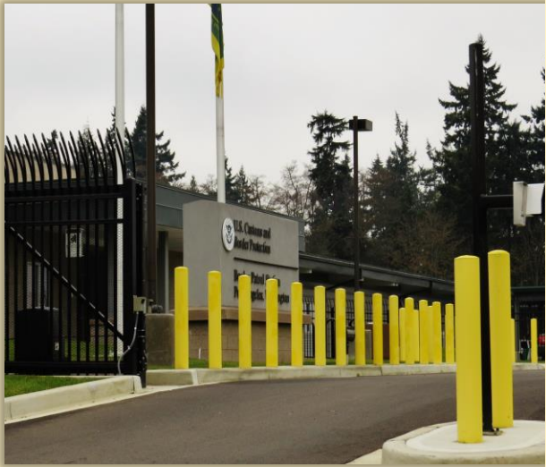
U.S. Border Patrol, Port Angeles Station, photo by author, 2013

In addition to expanding its infrastructure, the Department of Homeland Security (DHS), which oversees Border Patrol, has created incentives and mandates for local law enforcement agencies to collaborate with Border Patrol, with the goal of interoperability between them. These mandates impact at least thirteen state, federal, and tribal law enforcement agencies operating on the west end of the Peninsula alone. 10