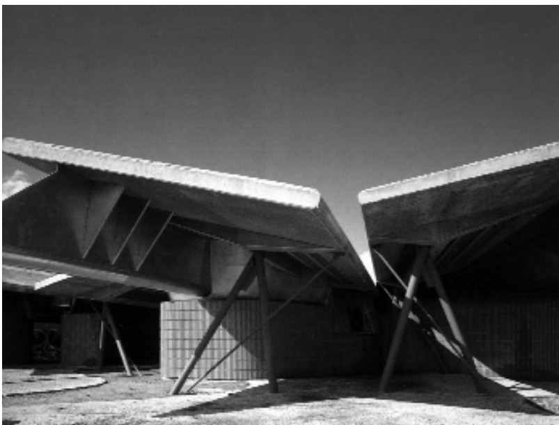
Picture 10 Barcelona Archery Range, 1991, Miralles & Pinós.

In describing the Suvikumpu housing estate, Pietilä remarks that “the disposition of the mass of buildings is isomorphic with the topographical forms of the site. The mass is broken down like the irregularly eroded rock, responding in the isomorphoses of the horizontal and vertical directions to the form of the rock itself”. 26 Pietilä’s landscape or site-inspired form language stands out from the mainstream of Finnish modernism: his construction form emerges from natural form through abstraction, simplification and “straightening”. Aalto’s characteristic free-flowing curve symbolizes the presence of nature’s irregularity. To Pietilä, geometry is artificial, while topology is natural, representing the gradual transformation and variation of form which generates form relationships or form families. Constructing an entity, these form families are fragments of forms constituting a coherent series of variations and a connection to the structure of the surrounding landscape. Pietilä himself explains the background for his architecture as follows: