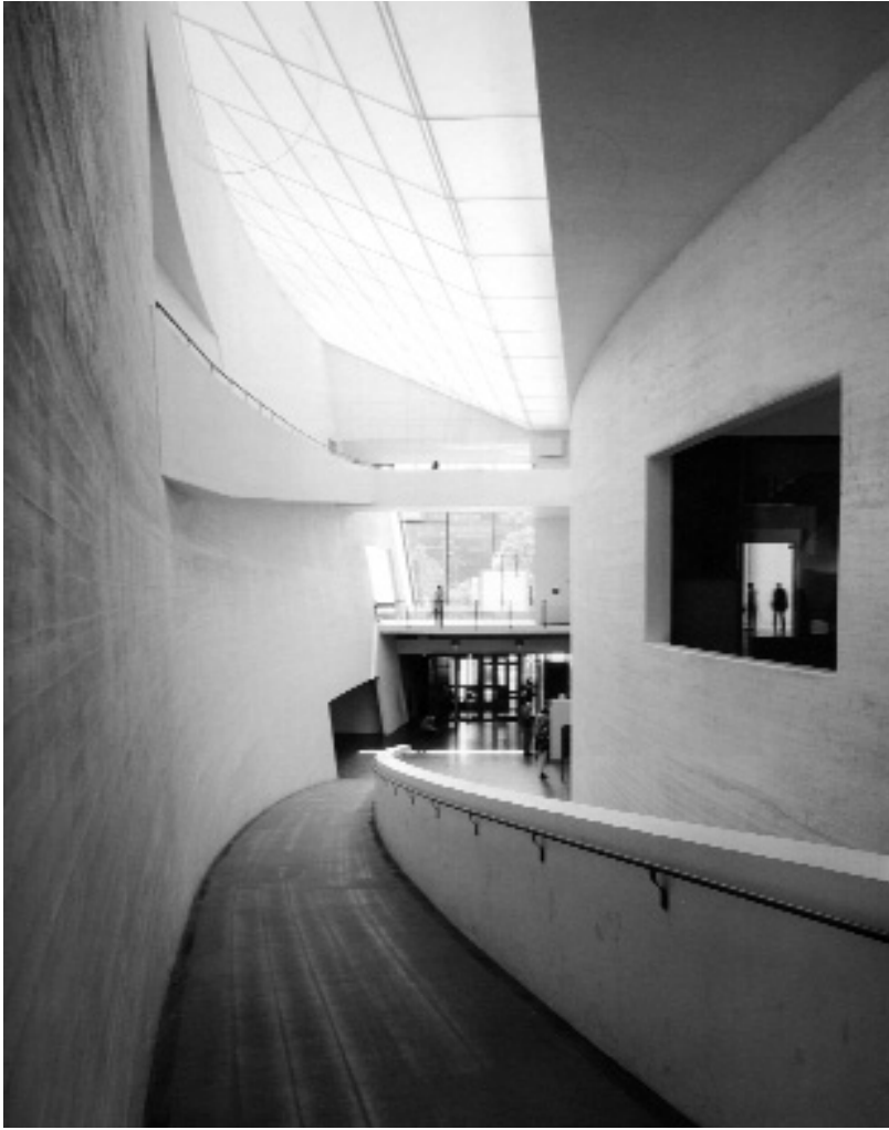
Picture 14 Kiasma, Helsinki, 1998, Steven Holl.

As a design object, "place" is different from building. When we design a building, the emphasis tends to fall on surface projections, ground plans, facades and their internal and mutual relationships. The focus is thus on the two-dimensional structuring of surfaces. Key points of interest are what the building looks like and what impression the surfaces create. Place as a design object involves having a conscious relationship with the environment and an awareness of depth. When the design focus is on place, we are actually designing the relationship between a building and its environment. We thus zoom in on the depth impression of the site rather than the building surfaces. A cross-section or perspective drawing can be used to relate the structure of the building to that of the site or, conversely, elucidate how the spatial structure of the site is reflected on that of the building. Manipulation of the structure of the site gives rise to the building's relationship with the surrounding landscape, the characteristic integration of natural landscape in architecture.