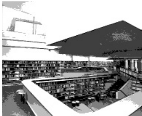
Picture 5 Rovaniemi Library, 1968, Alvar Aalto. In Aalto's Rovaniemi Library, lighting from above in conjunction with reading hollows creates fundamental spatial relations, which are familiar to us from the natural environment. Lit obliquely from above, the niches seem to offer shelter and comfort which is comparable to that of forest rooms, whose sense of space inescapably invites us to spend time in them. In every library he has designed, Aalto uses the decorative quality of bookshelves and backs of books as spatial elements; the shelves form arbitrary raanu-like hangings on the walls, which serve to provide a white background – an essential element in this context. At the same time, the shelves comprise a geometric element that complements the otherwise mainly topologically structured space.