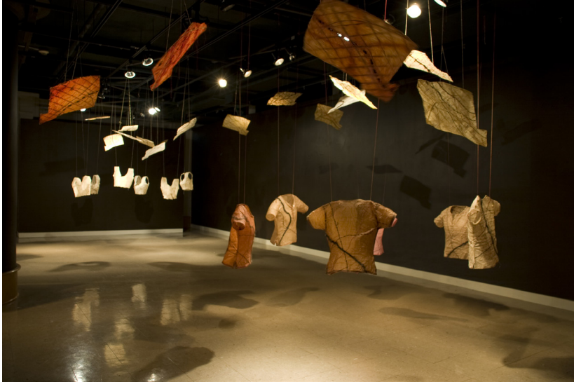
Figure 3. Installation view 3. Remembering the Crooked Line . © Pritika Chowdhry, 2009.

the affective circulation of collective memory by conveying what is left unsaid to audiences: namely, the simultaneous existence of pleasure and violence, life and death, as it is aesthetically re-membered through the partitioned body's trace.