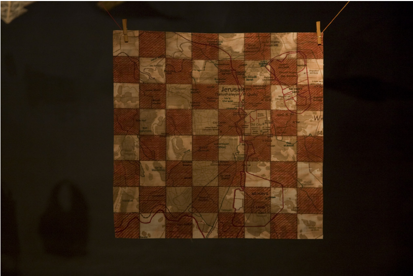
Figure 5. "Lines of Control," detailed maps of fictional partitions: Iraq into "Sunnistan," "Kurdistan," and "Shiastan" (top), and Jerusalem into Israeli and Palestinian segments (bottom). Remembering the Crooked Line . © Pritika Chowdhry, 2009.