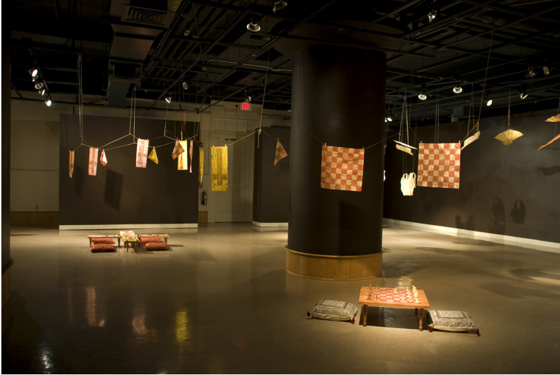
Figure 2. Installation view 2, Remembering the Crooked Line . © Pritika Chowdhry, 2009.

Likewise, the poetics of Remembering the Crooked Line are sensed by what is simultaneously present and absent from the visual scene the artist has conjured: the material body itself. Accordingly, it is the body's absence that produces its material (read: affective) traces, or presence, throughout the exhibition space (see figures 1 and 2).