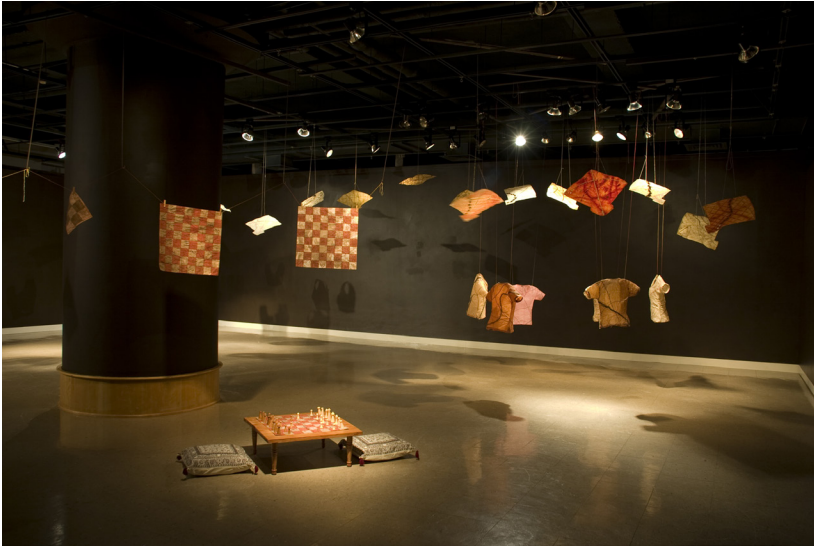
Figure 1. Installation view 1. Remembering the Crooked Line . © Pritika Chowdhry, 2009.

Remembering the Crooked Line (2009), by feminist artist and scholar, Pritika Chowdhry, is dedicated to understanding the role of partitions in historical and contemporary conditions. Chowdhry, a diasporic Indian and now U.S. citizen, is two generations removed from the events of the 1947 Partition of India, which dislocated an estimated 12 million from the subcontinent during the British-led creation of two separate countries: India, a country for Hindus, and Pakistan, a country for Muslims.