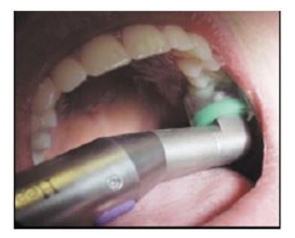
Figure 3. Heal Ozone delivers ozone gas through a base and handpiece into a polymer cup that is placed around the tooth surface to be treated.

The HealOzone unit is made by CurOzone and distributed by KaVo Dental Limited. It delivers a 10-second burst of ozone gas at a pre-set concentration, through a hose and hand piece, into a polymer cup that is placed around the tooth surface to be treated (Figure 3).