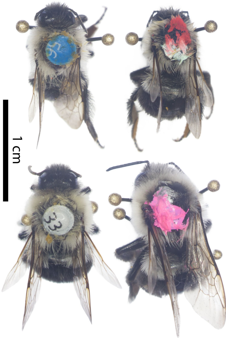
Figure 1. Individuals of Bombus (Pyrobombus) impatiens Cresson marked with bee tags (left) and paint (right). Scale bar = 1 cm.

California) and transferred the bee from the aspirator tube into a queen-marking cage with a plunger (The Bee Works, Oro-Medonte, Ontario, Canada). We gently pressed